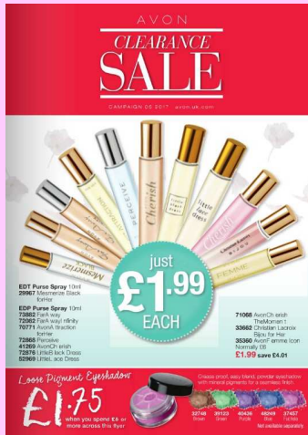
Sale Brochure 05-2017 For Delivery after 18-Feb