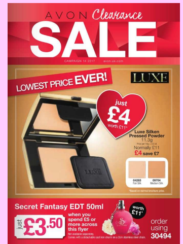
Sale Brochure 14-2017 For Delivery after 26-Aug