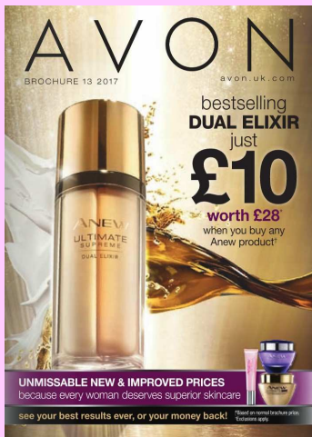
Brochure 13-2017 For Delivery after 5-Aug