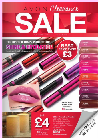
Sale Brochure 11-2017 For Delivery after 24-Jun