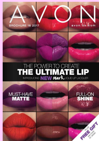
Brochure 16-2017 For Delivery after 7-Oct