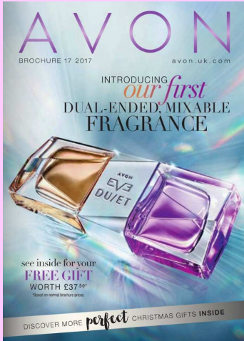
Brochure 17-2017 For Delivery after 28-Oct