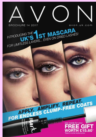
Brochure 14-2017 For Delivery after 26-Aug