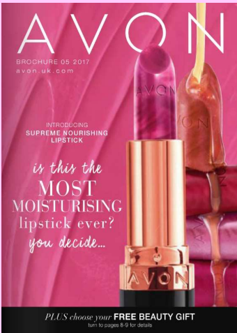
Brochure 05-2017 For Delivery after 18-Feb