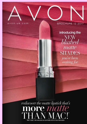
Brochure 12-2017 For Delivery after 15-Jul