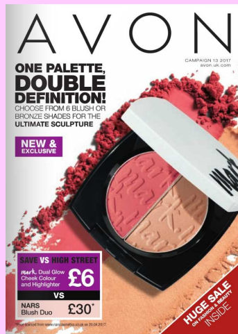
Sale Brochure 13-2017 For Delivery after 5-Aug