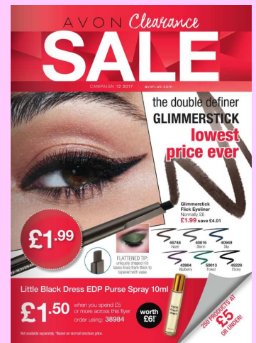
Sale Brochure 12-2017 For Delivery after 15-Jul