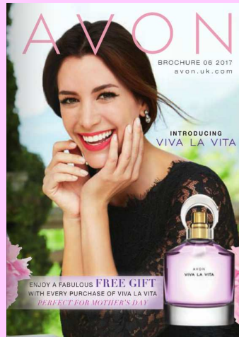
Brochure 06-2017 For Delivery after 11-Mar