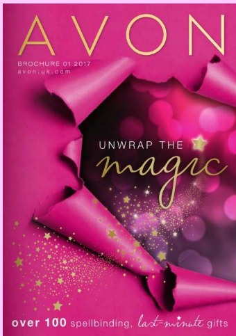
Brochure 01-2017 For Delivery after 10-Dec