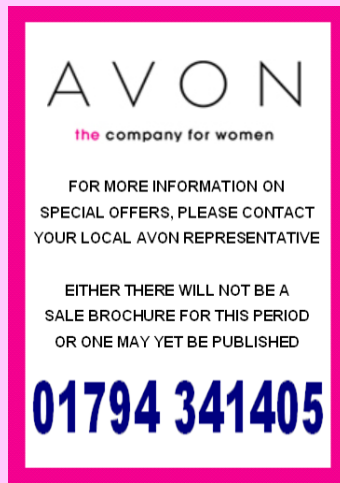
Sale Brochure 03-2017 For Delivery after 14-Jan