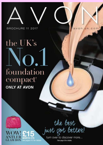
Brochure 11-2017 For Delivery after 24-Jun