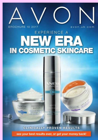
Brochure 10-2017 For Delivery after 3-Jun