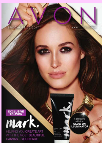
Brochure 09-2017 For Delivery after 13-May