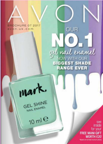
Brochure 07-2017 For Delivery after 1-Apr