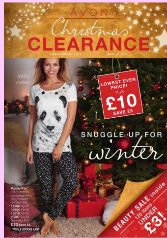
Sale Brochure 01-2017 For Delivery after 10-Dec