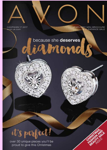
Sale Brochure 17-2017 For Delivery after 28-Oct