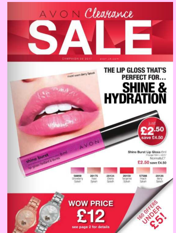
Sale Brochure 06-2017 For Delivery after 11-Mar