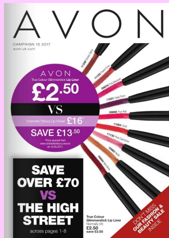
Sale Brochure 15-2017 For Delivery after 16-Sep