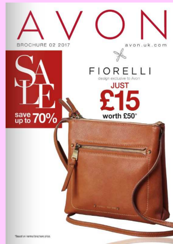
Brochure 02-2017 For Delivery after 24-Dec