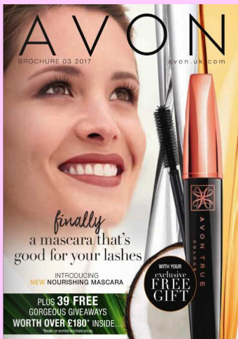
Brochure 03-2017 For Delivery after 14-Jan