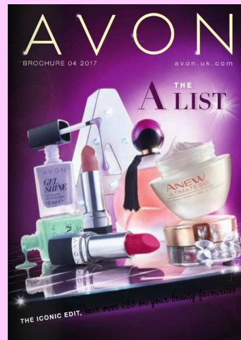
Brochure 04-2017 For Delivery after 28-Jan