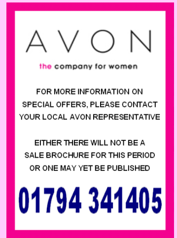
Sale Brochure 02-2017 For Delivery after 24-Dec