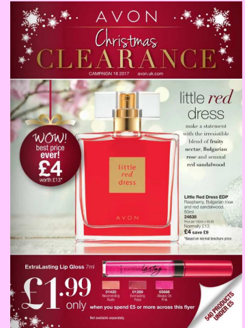
Sale Brochure 18-2017 For Delivery after 18-Nov