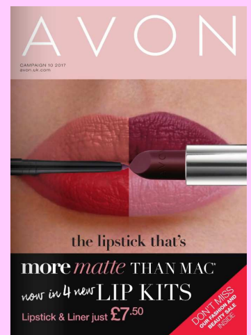
Sale Brochure 10-2017 For Delivery after 3-Jun