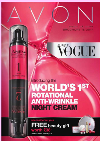
Brochure 15-2017 For Delivery after 16-Sep