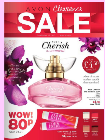
Sale Brochure 16-2017 For Delivery after 7-Oct