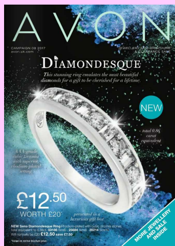
Sale Brochure 09-2017 For Delivery after 13-May