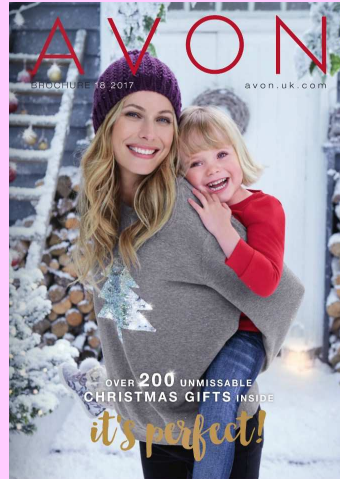
Brochure 18-2017 For Delivery after 18-Nov