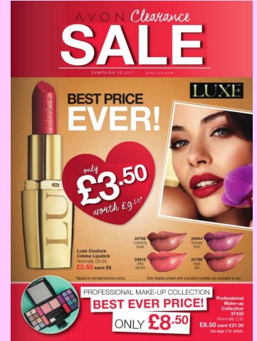
Sale Brochure 08-2017 For Delivery after 22-Apr