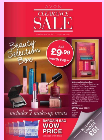
Sale Brochure 04-2017 For Delivery after 28-Jan