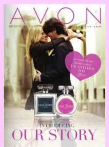
Brochure 03-2014 For Delivery after 23-Jan