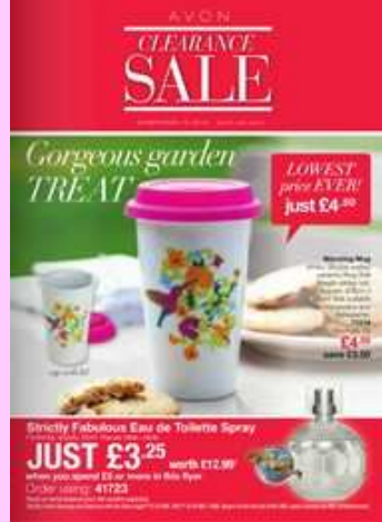
Sale Brochure 15-2014 For Delivery after 25-Sep