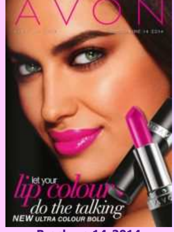
Brochure 14-2014 For Delivery after 4-Sep

Sale Brochure 13-2014 For Delivery after 14-Aug