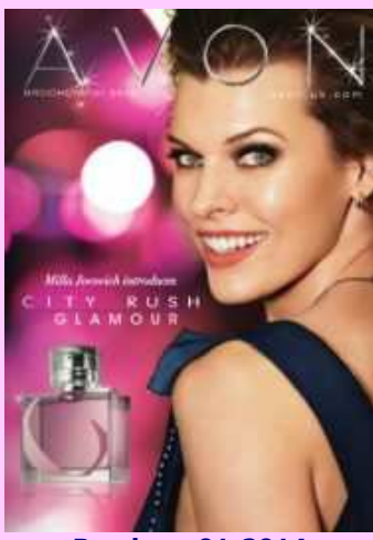
Brochure 01-2014 For Delivery after 19-Dec