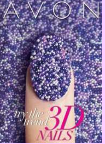
Brochure 12-2014 For Delivery after 24-Jul