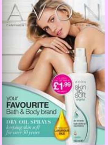
Sale Brochure 12-2014 For Delivery after 24-Jul