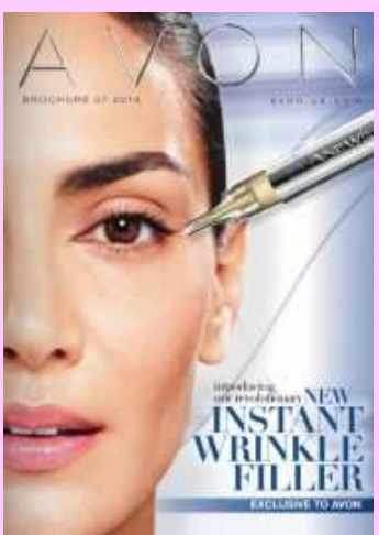
Brochure 07-2014 For Delivery after 10-Apr