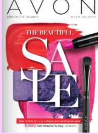
Brochure 02-2014 For Delivery after 09-Jan

Sale Brochure 01-2014 For Delivery after 19-Dec