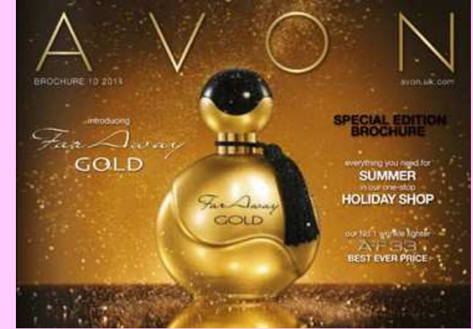
Brochure 10-2014 For Delivery after 12-Jun

Sale Brochure 10-2014 For Delivery after 12-Jun