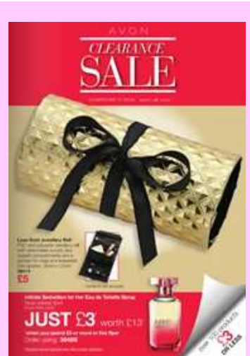
Sale Brochure 11-2014 For Delivery after 3-Jul