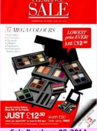
Sale Brochure 08-2014 For Delivery after 1-May