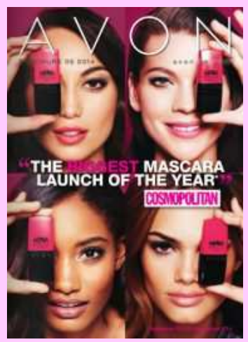
Brochure 05-2014 For Delivery after 27-Feb