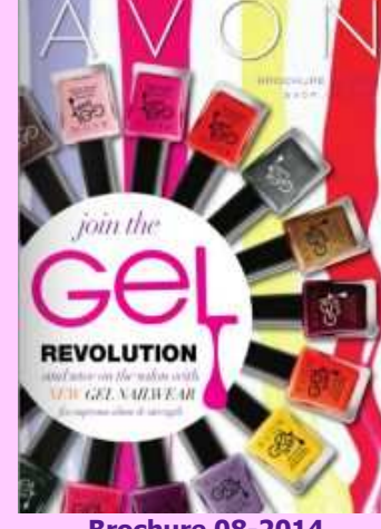
Brochure 08-2014 For Delivery after 1-May

Sale Brochure 07-2014 For Delivery after 10-Apr