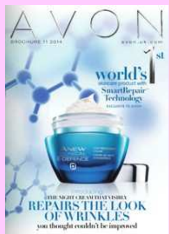
Brochure 11-2014 For Delivery after 3-Jul