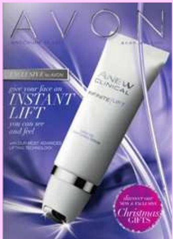
Brochure 16-2014 For Delivery after 16-Oct