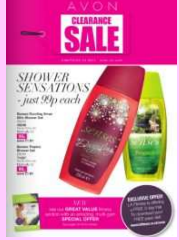
Sale Brochure 04-2014 For Delivery after 06-Feb

Brochure 04-2014 For Delivery after 06-Feb