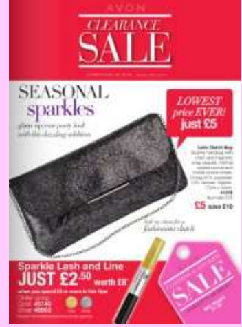
Sale Brochure 14-2014 For Delivery after 4-Sep