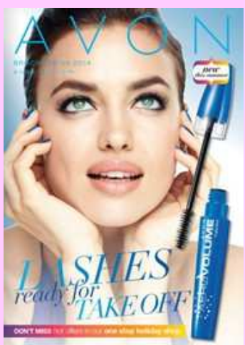
Brochure 09-2014 For Delivery after 22-May